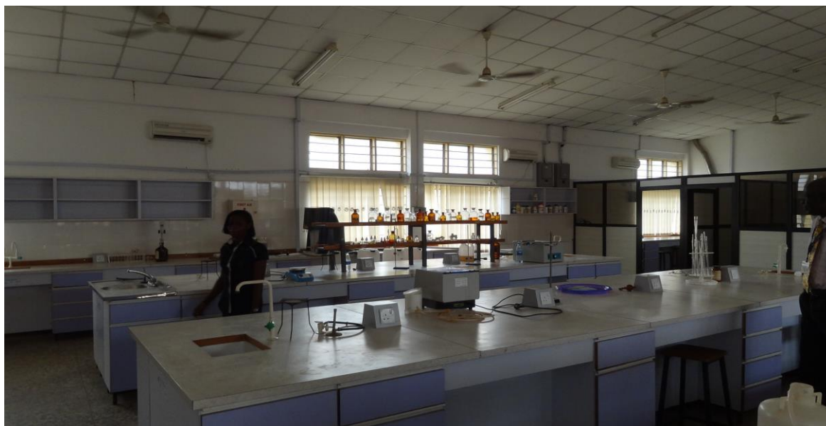
Teaching and Research Laboratory

The Central Teaching and Research Laboratory (CTRL) which serves as a means of promoting academic research excellence was established in 2009. The Laboratory has been equipped with sophisticated laboratory equipment for research that would enable the University carry out a wide range of specialized chemical and biological analyses which is to serve both its immediate Community and Researchers from surrounding Universities as well as Industries and government establishments on research and commercial basis.